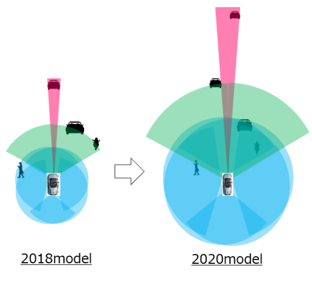
[downsized to less than 20% of "2018 model"]

MEMS mirror-based raster scanning method enables detection to be made at high temporal and spatial resolutions. Moreover, with an improved measurement distance of 1.5 to 2 times over "2018model" and other advancements, high-precision detection ability has been achieved for autonomous driving vehicles and a wide range of other applications.